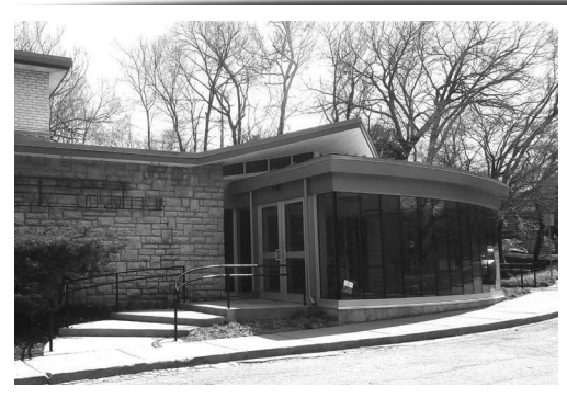
Westport Roanoke Center

KC Parks is offering 10 weeks of summer camps for children ages 6-13 at Westport Roanoke, Gregg/Klice, and Tony Aguirre for $80/week. Swim lessons are available at Brush Creek, Gregg/Klice, and Tony Aguirre. Level 1 & 2 lessons are free! Find more info in the 2018 Spring & Summer Fun Guide at kcparks.org/spring-summer-guide . Call or visit each center to get more information and register for programs.