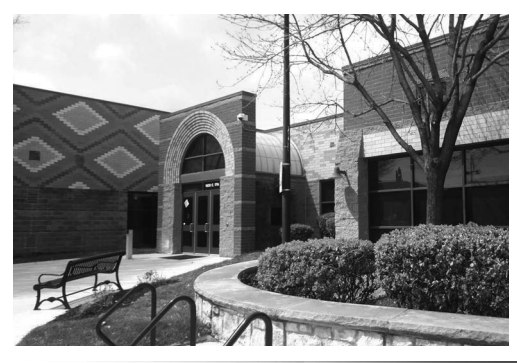
Gregg Klice Community Center