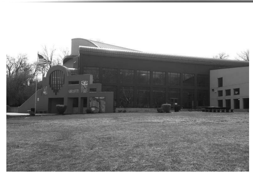
Tony Aguirre Community Center

Westport Roanoke: 3601 Roanoke Rd. 816-513-7660