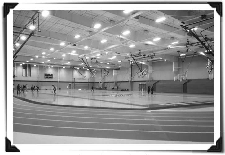
Indoor track at Cental Academy.

There are also many public and tuition-free charter high schools nearby. Among these are Allen Village in Westport; DeLaSalle Charter and Frontier School of Excellence both located on Troost; Kauffman School, Hogan Preparatory, and University Academy to the south; Guadalupe Centers High School (formerly Alta Vista) in the Northeast, and the new Crossroads High School downtown. Charter schools also enroll students living