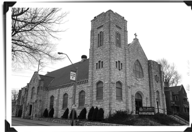
Saint James Catholic Church